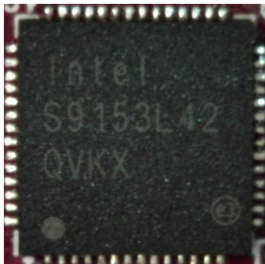
Figure 1-1 Snapshot of I225

Figure 1-1 shows a snapshot of the I225 device: