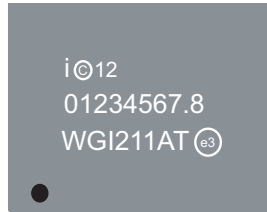
Figure 1-1 I211 Production Top Marking Example