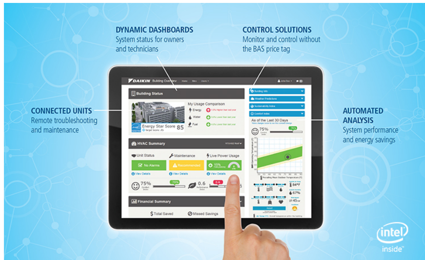
Figure 1.2 Daikin Intelligent Equipment Offerings Overview

The solution offers customers with packaged rooftop systems as their primary HVAC solution an alternative to the traditional management approach supported by external controls contractors or traditional building automation systems. Intelligent Equipment offers remote access, trend information, energy monitoring and management, diagnostics, and alarm management as an embedded feature of the new rooftop unit. The image below illustrates the visualization and reporting interface accessible via Daikin Intelligent Equipment.